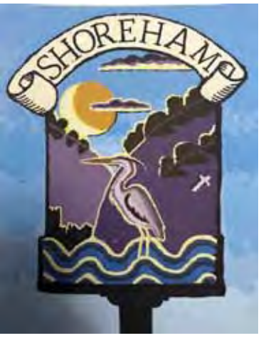
Runners up for Parish wide sign design competition